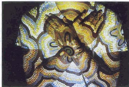
BY MADDIE FARACE